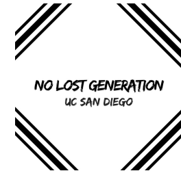
No Lost Generation