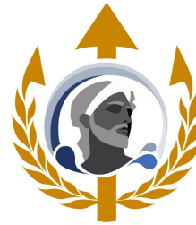
Model United Nations