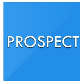
PROSPECT Journal of International Affairs