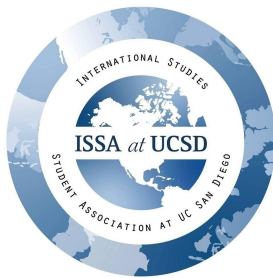
International Studies Student Association (ISSA)